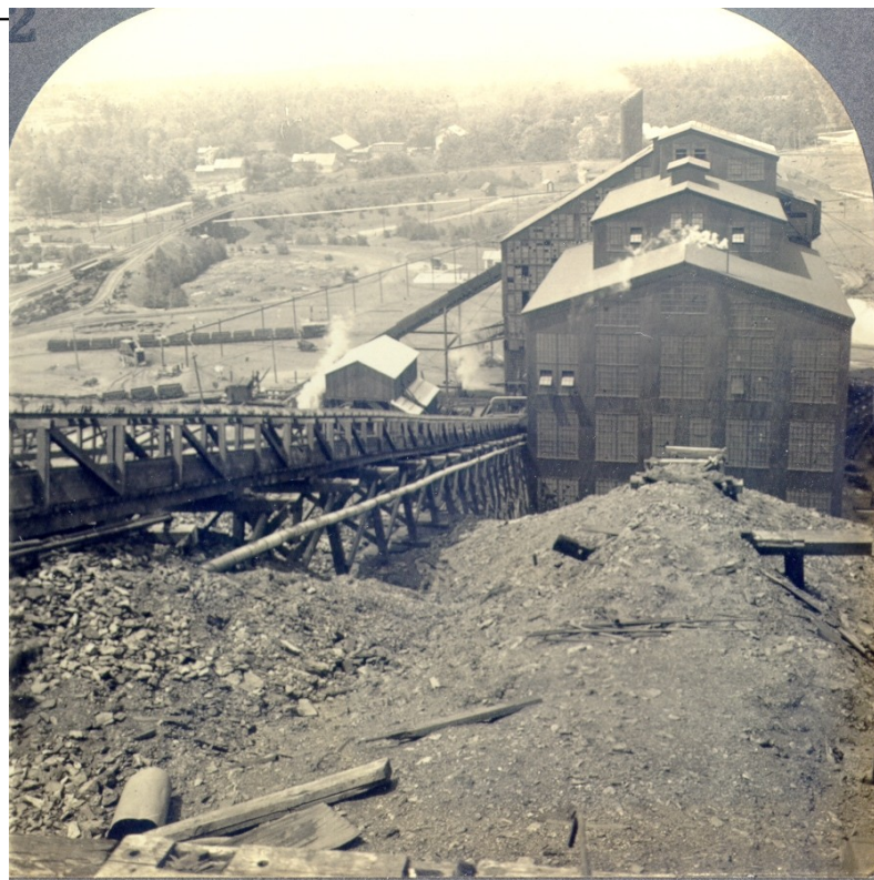
V20892—Typical Steel Coal Breaker From Culm Heap. Anthracite Fields, Pennsylvania.