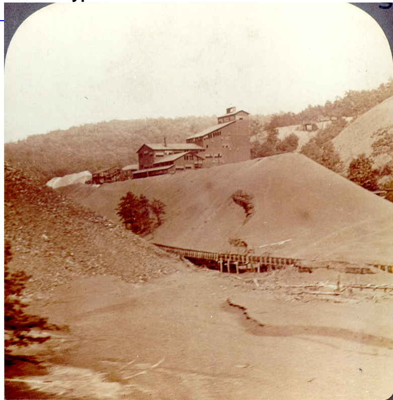
11241 - Typical coal breaker with culm heaps, anthracite fields Pennsylvania. Copyright Underwood & Underwood, U-54612